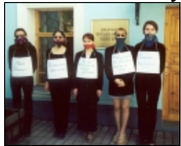
Street theatre in Yaroslavl, May 16, 2001

On May 16<sup>th</sup>, 2001 the Angel Coalition, a consortium of 43 Russian NGO's, launched an intensive 100 day anti-trafficking campaign in Moscow, St. Petersburg, Nizhni Novgorod, Yaroslavl, Petrozavodsk and Veliki Novgorod with simultaneous press conferences in all six sites and the distribution of campaign literature, bus posters, metro cards, TV and radio spots. During the course of the campaign, over 1000 community volunteers in six regions distributed 50,000 posters, 600,000 information booklets, 100,000 stickers, 5,000 buttons, 25,000 printed packets and 12,000 bus/metro placards. Community action events included organizing parades, demonstrations, lectures, and legislative activity.