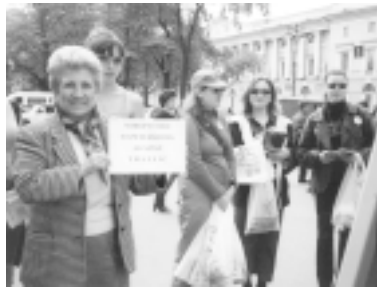
Soroptimists clubs and women's groups throughout St. Petersburg demonstrate against trafficking of young women

Like any media campaign, after all the radio and TV and media coverage dies down, it is critical to follow up with continuing public education. Although the Angel Coalition is not yet self-supporting, MiraMed is supplying office space and financial support for a Moscow-based executive director. Grants for the establishment of safe houses for returned and rescued trafficking victims, as well as for continued funding of education efforts, are pending. (Partial funding for the establishment of