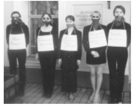
At the Yaroslavl press conference young women demonstrate against trafficking

safe houses in St. Petersburg, Moscow, Chelyabinsk and Nizhni Novgorod has already been received; see article on page 2).