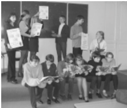
These young people are all from orphanages in Nizhni Novgorod, where on May 21 Youth Action Against Trafficking of Children took place as part of the Public Information Campaign