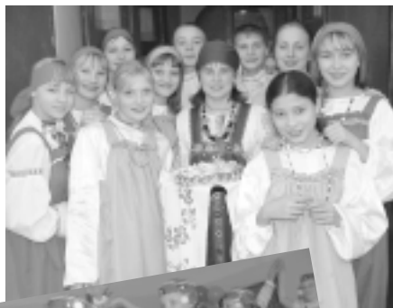
October 9: Students on grand opening day of the Independent Living Center in Smolensk

As MILSAC continues to expand and improve the lives of thousands of orphans, we wish to thank all sponsors, partners, volunteers, and especially our students for all their hard work to make themselves and their lives better! ❄