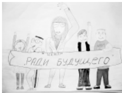
MILSAC Smolensk: Kids' drawing reads “The Center of Hope for the Future”