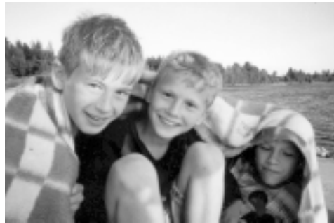
Young boys enjoy summer sun in Svir Stroi