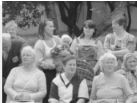
Teenage mothers and their babies enjoy an outdoor concert with their “babushka” mentors at the Tsaritsyn Community Center.

I N AUGUST, MIRAMED BEGAN A NEW program for young single teenaged mothers at the Tsaritsyn Community Center in southwest Moscow with support from the “World Childhood Foundation” founded by Queen Silvia of Sweden . Within six weeks, more than 150 young mothers—from 16–23, had enrolled. The program includes infant and maternal health care, motherhood education and training, group and individual social work, a “Mother’s Club” where single moms can share their feelings, a clothing bank and daily meal prepared by the young moms and the volunteer pensioners or “babushkas” who serve as their mentors in the program. A computer center, donated by STS Television, will be used for training in word processing and other job skills which are very much in demand in Russia.