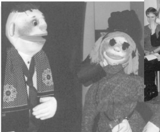
The “suave” businessman trafficker tries to convince “Elena” to come to Paris.

A S PART OF OUR CONTINUING ANTI-TRAFFICKING EDUCATIONAL EFFORTS, MiraMed has developed an in-school, interactive, anti-trafficking play featuring live actors wearing full-size puppets. Before and after the show, students complete a one-page questionnaire on what they want to do after graduation and their feelings about working overseas. The 25-minute in-classroom production is followed by a discussion about trafficking with the teacher and actors and each student receives a copy of the Angel Coalition anti-trafficking brochure. The production uses the same talent that created the TV spots for the Angel Coalition/MiraMed anti-trafficking media campaign that ran last May. “Let’s go to Paris” features a