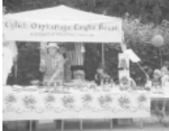
The Uglich Orphanage Crafts Booth was a big hit on the 4th of July selling crafts and T-shirts.

Each year the American Chamber of Commerce in Russia , of which MiraMed is a member, holds a big Independence Day celebration for members, the expat community and their Russian