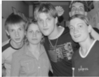
Some of the older orphans mugging for the camera at MiraMed's Moscow Center

with a more highly qualified group of social pedagogues and psychologists than ever before, the Center staff in