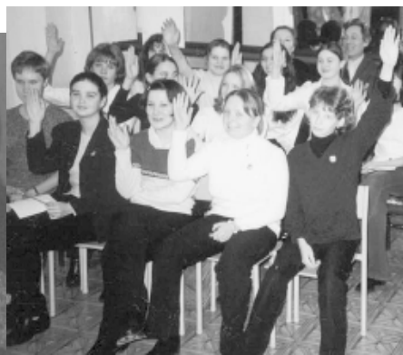
After the production, the all-girl high school audience raises their hands when asked whether or not they will “think twice and get the facts” before accepting work overseas.

suave businessman/trafficker and his attractive 20’s something accomplice. They invite the young unsuspecting “Elena” to come to Paris to “have a great life.” Using audience participation, improvisation and songs from Britney Spears, all three characters dance and sing together which adds a strong dose of contemporary Russian teenage life to the production. We are currently seeking funding to bring this production to a wide audience of school children and the theatre company is so excited about the potential of “social action” theatre that they have formed a new company called “Theatre for a Change” that will focus solely on the development of other such “socially relevant” productions. ✨