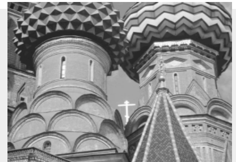
Beautifully restored St. Basil’s Cathedral is the jewel of fabulous Red Square, Moscow one of the many highlights of our wonderful 12-day Discover Russia Cruise!

W E’VE BEEN ENCOURAGING MIRAMED supporters to come to Russia since 1991—and the best way to see this very beautiful and endlessly fascinating country is by taking a river cruise between Moscow and St. Petersburg. This year, our “Travel with a Cause” program is extra special since the operator of the boat, Value World Tours, is giving MiraMed a $200 donation for each passenger who books a special July 8 or July 28 cruise!